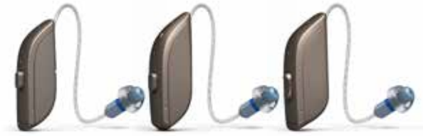
RT61-DRW RT61-DRWC RT62-DRW